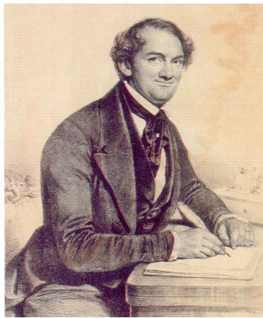
1850 Lithograph of P.T. Barnum

While tumbling into bed, Turner said to the tavern keeper "Do see sir, that our breakfast is all ready and on the table smoking hot in half an hour." While Turner took the business of negotiations very seriously, Barnum viewed the whole situation as a big joke. A half-hour later the men dressed, gathered their belongings, and marched down to breakfast. Quickly consuming another full meal, they then hit the road to Richmond for their next scheduled performance.